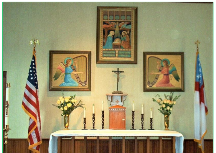
Saint Stephens as photographed by the editor in 2001

From the instant of Creation, He has built a dynamic into our fallen reality ... a dynamic that alters how things work or have to be. It's about our faith and obedience, and the power of our loving God. It helps us deal with the paradoxes of a furious world of dangerous nature and unsettled and chaotic peoples. Those are the questions for us all, when we bring our hopes and fears to God in prayer. Will we try to insist on His submitting to our demands? Or will we subordinate our hearts to the purposes of His will? Are we still trying to have our way with God, or have we really decided to let God have His way with us? Are we ready to trust in His mercy, and obey His will, leaving the outcome to Him? "Thy will be done" is really tough medicine for most of us. Jesus Christ gives us something to believe, and something to obey. Our faith is an act of obedience. It is action based on belief. Belief which is sometimes exquisitely and joyfully felt ... and sometimes acted upon in sheer and difficult obedience. We do it out of faithfulness. Sometimes we feel it and sometimes we don't. We are not the ravening crowd. We are the father pleading for his son. We plead from our state of utter powerlessness with contrite hearts and humbled spirits.