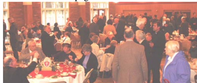
Enthronement Reception Luncheon at St. Peter's, Oakland, CA

Photographs of the Election of Archbishop Provenca, the Enthronement, and the National Clericus meeting are available on the APCK web site. Click on "View Photographs" in the lower left corner of the home page.